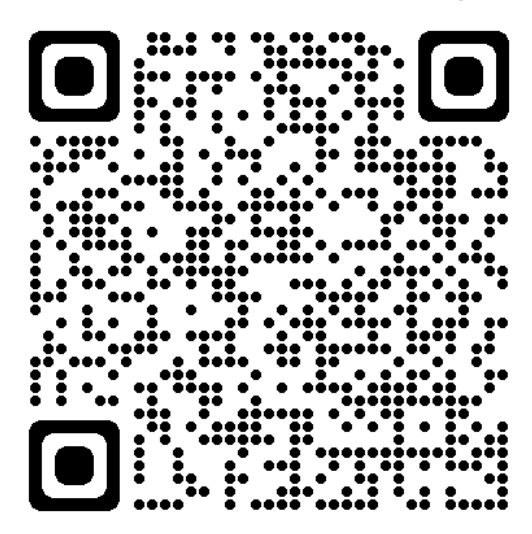
Applications to be made here: Bacon's College (applicaa.com)

Details of policy can be found here: Policies & Reports (baconscollege.co.uk)